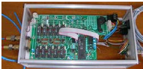
Figure 1. An electronic nose [2]

Electronic noses that mimic human olfactory system have sensors which can capture odor and convert it to digital signals. The history of electronic noses goes back to until 1970. Response of the sensors are transmitted parallel and it is combinatorial encoded [1], [2]. An electronic nose sample can be seen in figure 1.