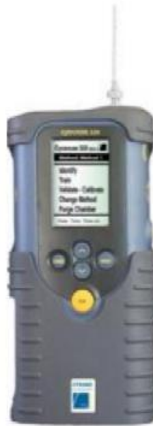
Figure 2. An hand held electronic nose

Table 1 lists some of the electronic nose devices which are large and bulky and some that are hand terminals and can produce successful results. For example the company "Cyrano Sciences Inc." has designed an electronic nose which is a hand held device and has used in many academic studies [4]–[13]. The device can be seen in figure 2 as an example.